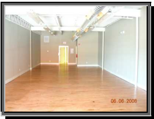
Typical Suite from Front Entrance