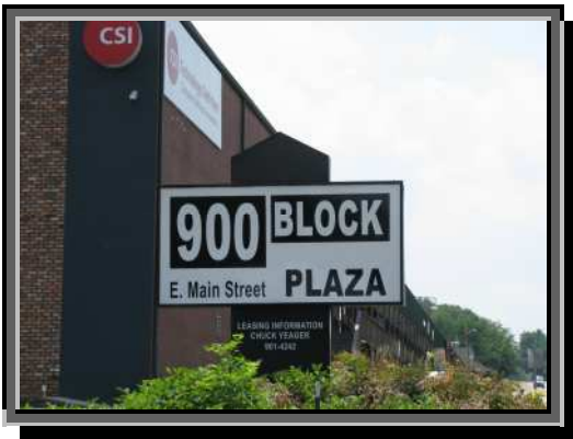
From E. Main Street (Hwy 93)