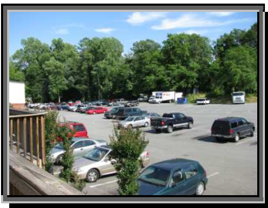
Rear Parking Lot