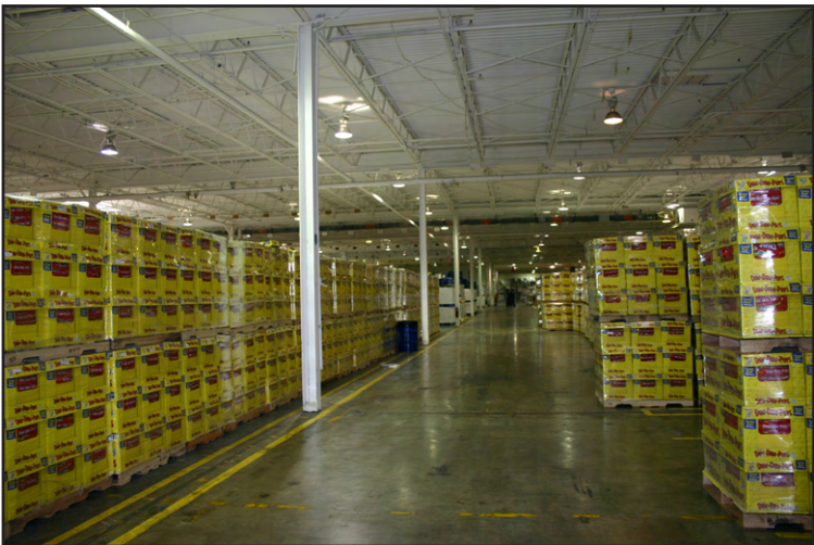
NEWLY PAINTED WHITE CEILING DECK