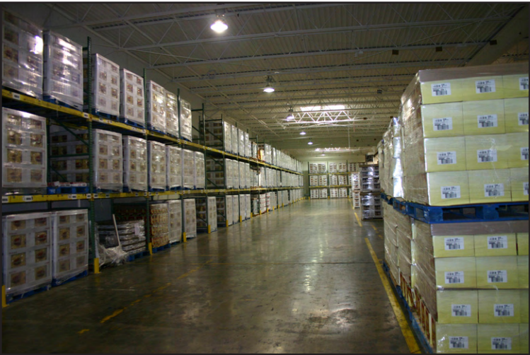
METAL HALIDE LIGHTING